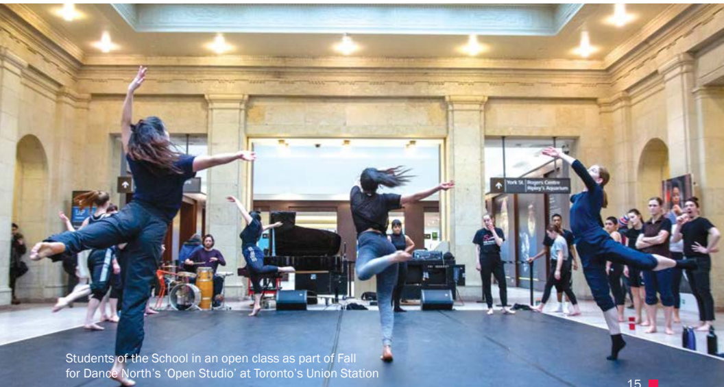
Students of the School in an open class as part of Fall for Dance North's 'Open Studio' at Toronto's Union Station

The School does not have housing or student residences, however we are able to provide information and guidance that may assist students in their search for housing.